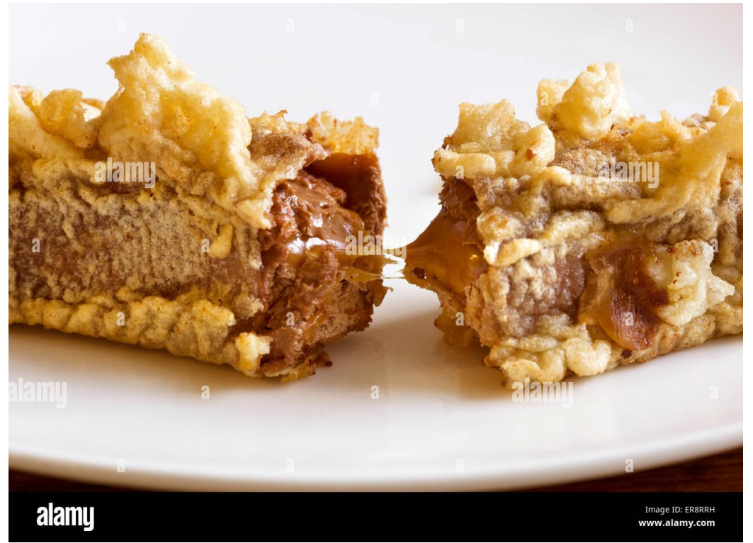
DEEP FRIED MARS BAR