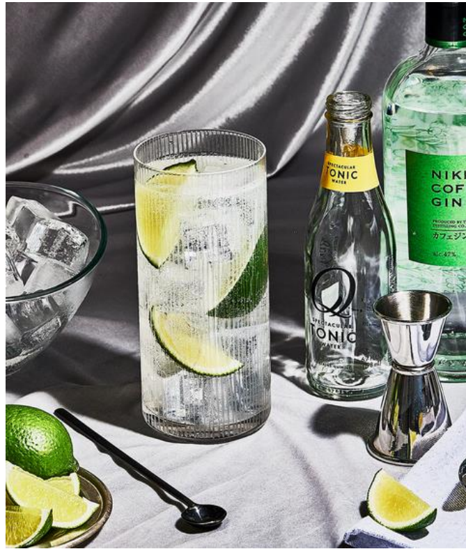
GIN & TONIC