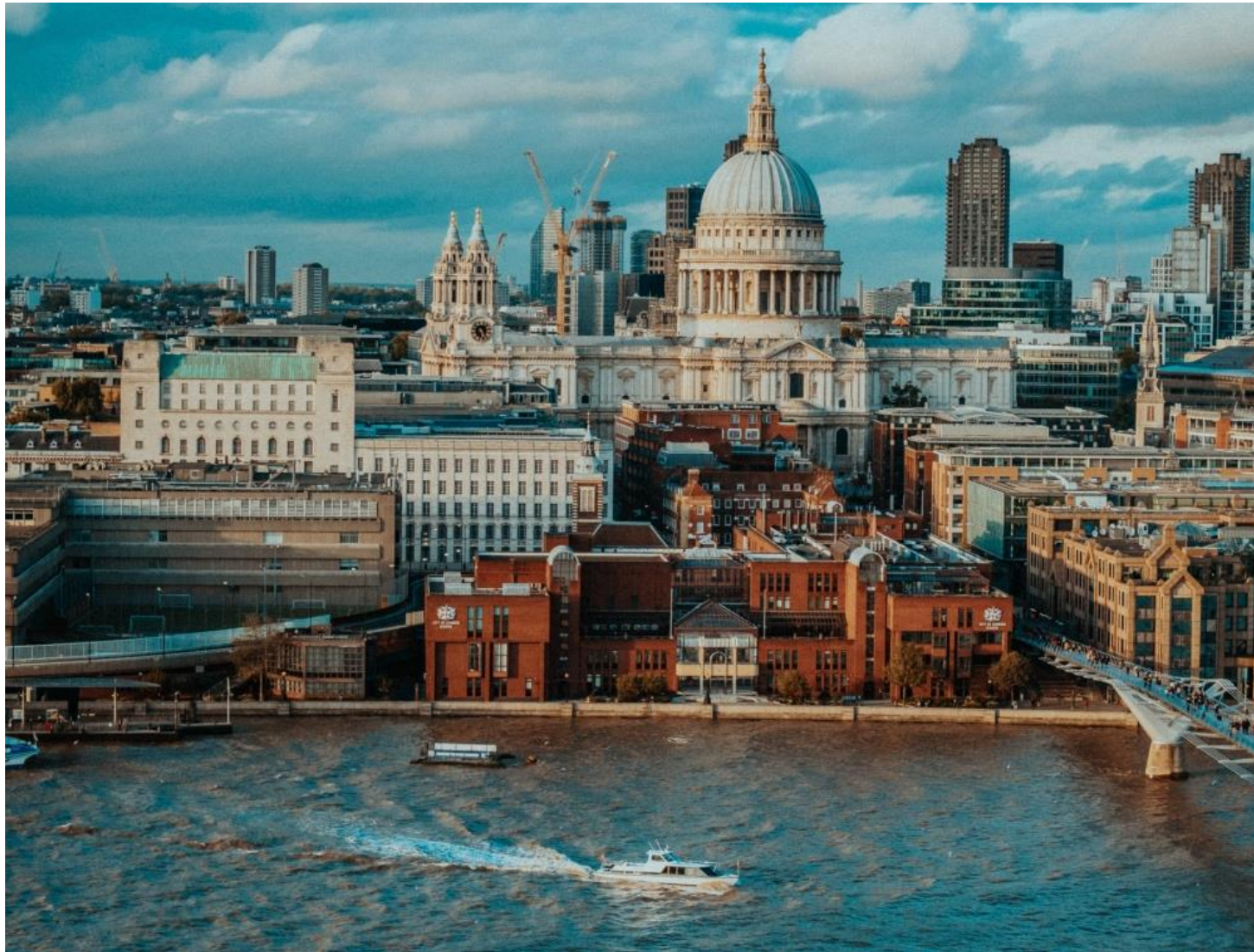
ST. PAULS CATHEDRAL